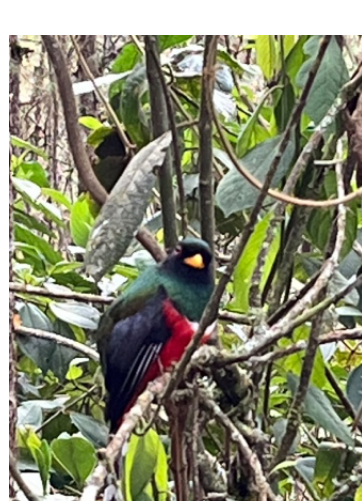
We ran into this guy on a hike.

As International Director for the Americas, my role is to give leadership and pastoral care to our missionaries as we seek to fulfill our mission of making disciples among all the nations of the Americas. We are working together to see Christ's Church established and strengthened so that the gospel of his kingdom will advance through all the world. Please pray for me in this mission!